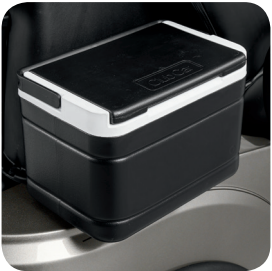
Caddy Master Cooler