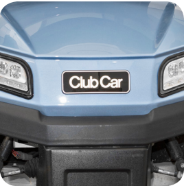
LED Name Plate