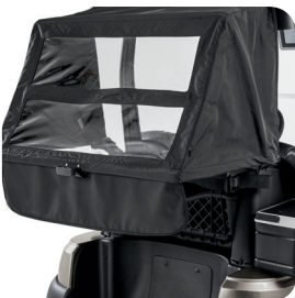
Bag Cover with Magnetic Latch