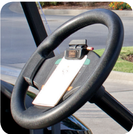
Comfort Grip Steering Wheel