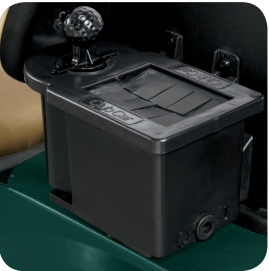
Ball and Club Cleaner