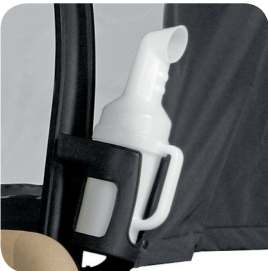
Divot Repair Sand Bottle