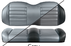
Gray Two-Tone Black and Gray Black also available