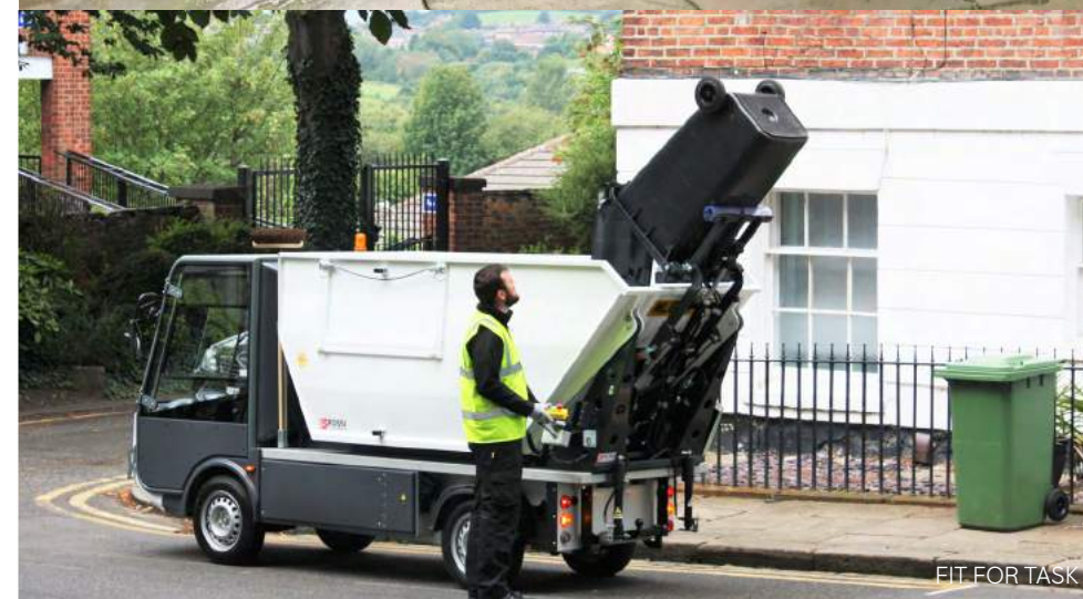
FIT FOR TASK

Operate individually, or as a satellite vehicle in a "hub and spoke" solution to complement your existing fleet.