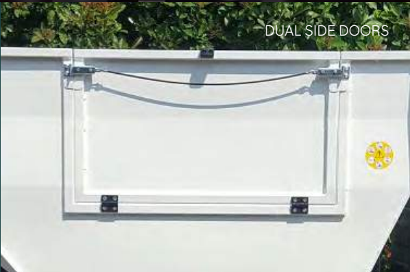
DUAL SIDE DOORS

Simple and easy to operate, with no additional licences required.