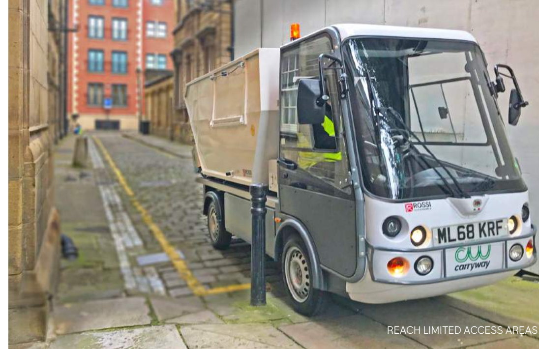
REACH LIMITED ACCESS AREAS

Operate individually, or as a satellite vehicle in a "hub and spoke" solution to complement your existing fleet.