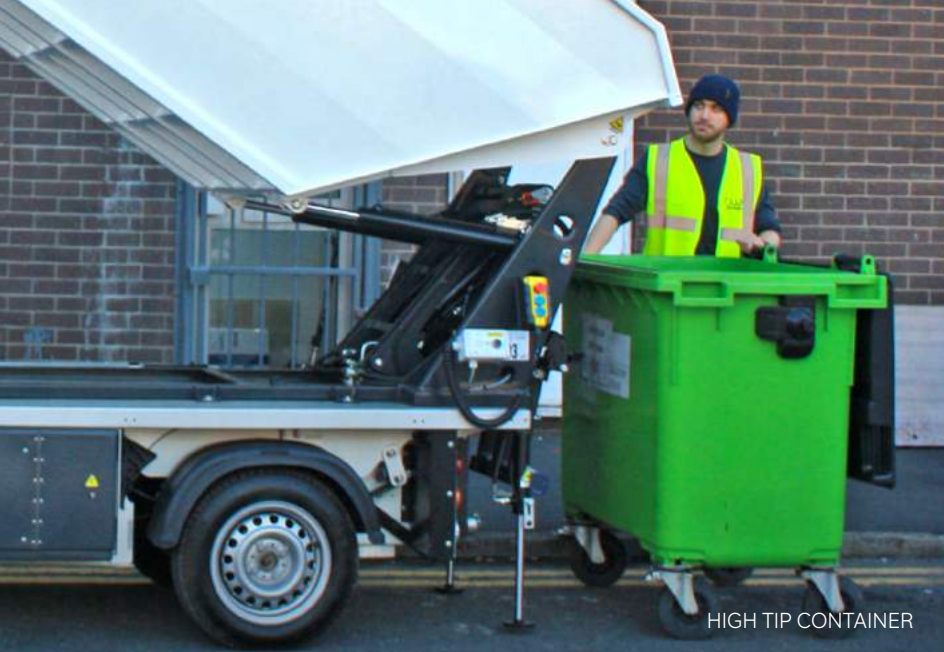
HIGH TIP CONTAINER

The zero-emissions Esagono Cit-E-Fox is designed and built fit for task.