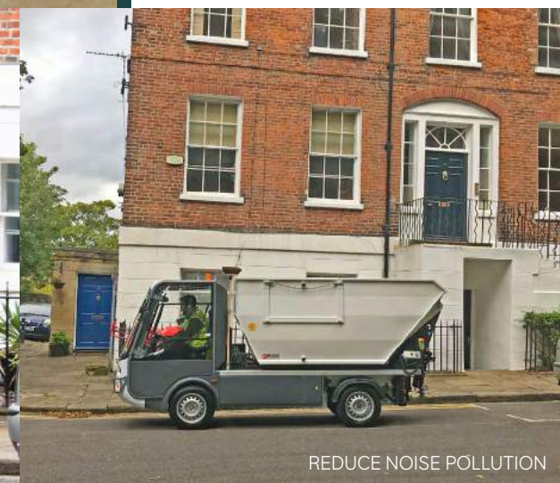
REDUCE NOISE POLLUTION