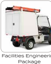
Facilities Engineering Package