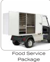
Food Service Package