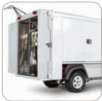
Van Box Options